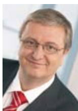
Vice-Chancellor Wilhelm Molterer Federal Minister of Finance

A handwritten signature in black ink, reading "Christoph Matznetter".